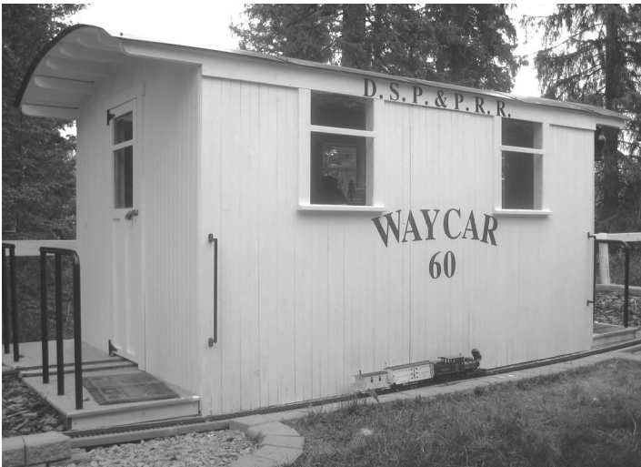
¾ side view of replica waycar #60

For more stories and information on my DSP&P model railway, go to www.ross-crain.com/modeltrains.htm .