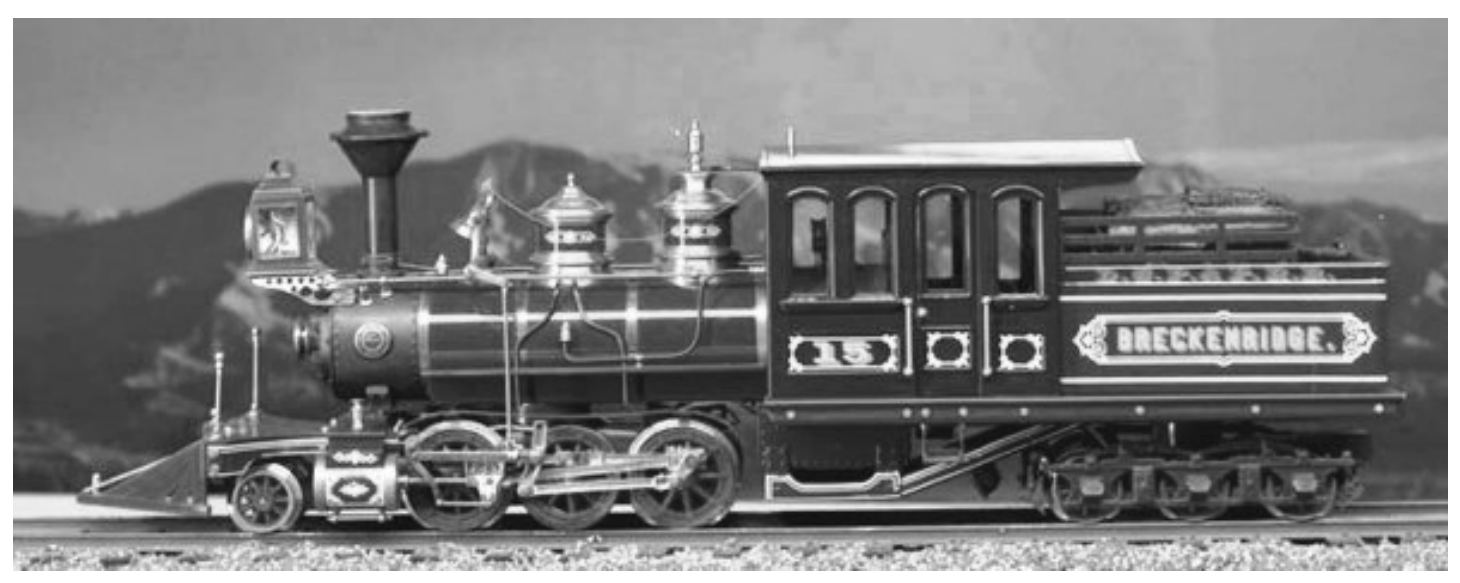
Builder's photo of DSP&P #15 "Breckenridge"